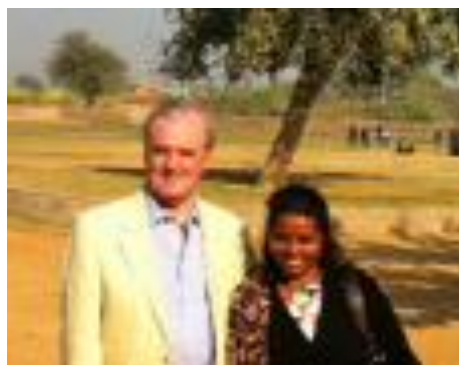
Symphony’s Deputy Chairman with the Headmistress

The school puts a strong emphasis on character development and building confidence rather than outright academic achievement. Characteristics like reliability, punctuality, honesty, teamwork and problem solving are included in the range of aspects that are taught. This doesn’t lessen the need for a complete and thorough education. The syllabus includes Maths, English, Music, Art and Sport and there are A-stream classes for those who would otherwise not benefit from lower standards of teaching.